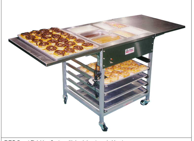
DFC Donut Finishing Center with iced donuts on baking trays