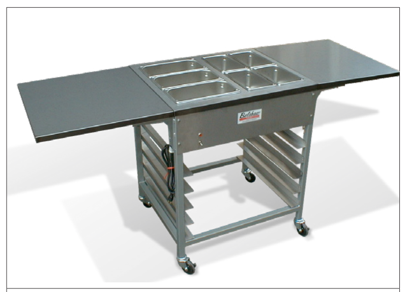
DFC Donut Finishing Center