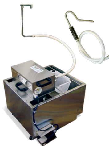
EZMelt 24 Shortening Melter-Filter