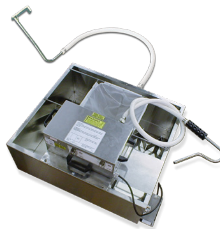
EZMelt 34 Shortening Melter-Filter