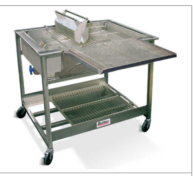
HG24C Donut Glazer *Glazing screens supplied separately