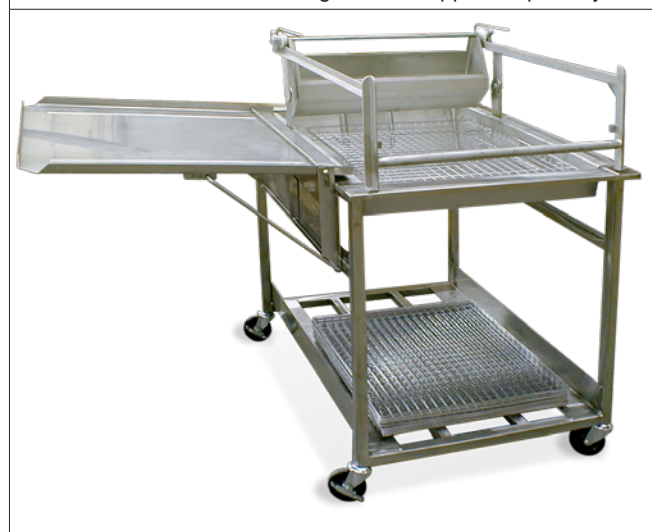
HG24EZ Donut Glazer with EZLift *Glazing screens supplied separately)