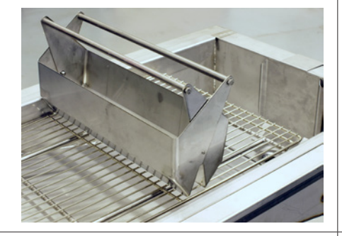
HG24C Clamshell glaze applicator (handheld)