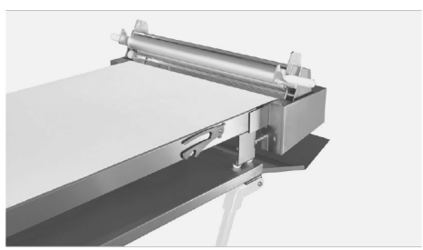
FAST700PAV (AUTOMATIC SPOOLING)