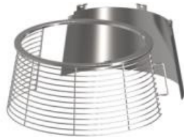
Stainless Steel Grid